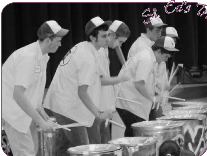
St. Ed's Trash Talkers